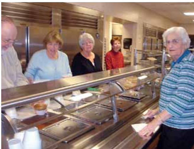
Volunteers serve up a delicious meal at the Soup and Sandwich Supper.